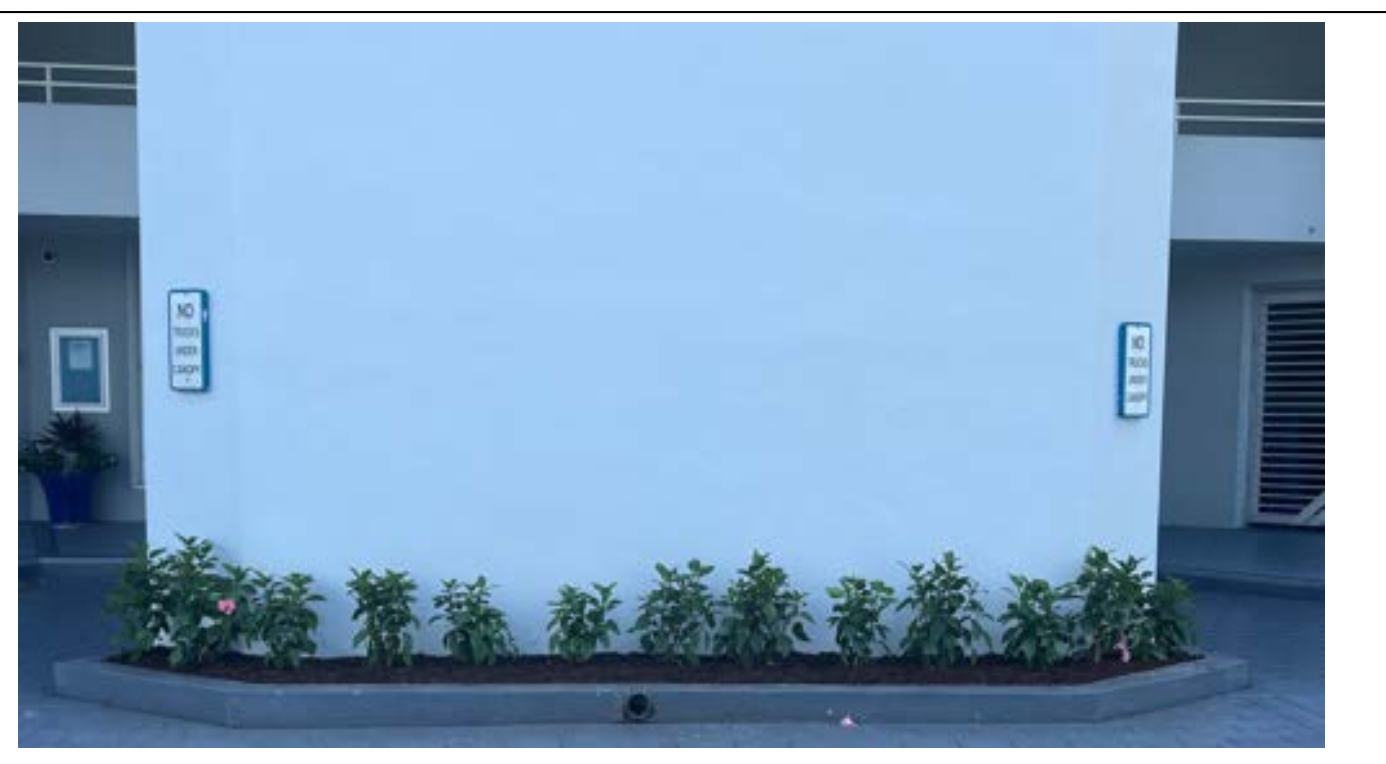
The portico wall got a fresh coat of paint and some new plants!

or on the website: www.empresscondo.org.