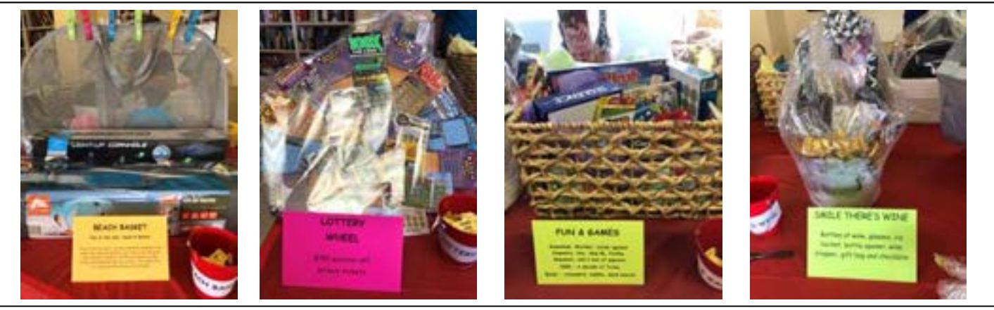
A few of the baskets raffled off....