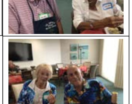
MEMORIAL DAY 2023