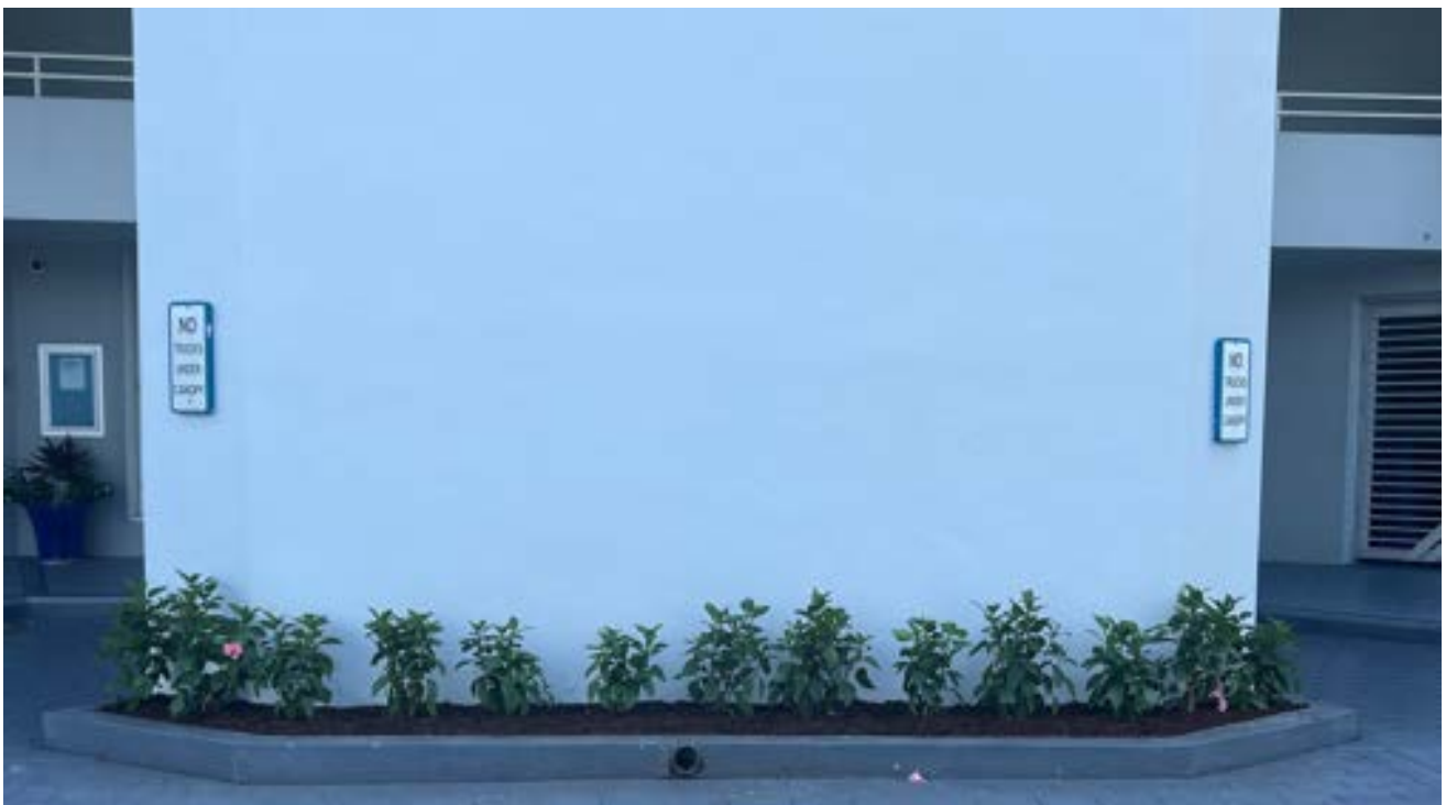
The portico wall got a fresh coat of paint and some new plants!

If you do not have a copy of this plan, you can obtain one from the Office, either by email or hard copy, or on the website: www.empresscondo.org .