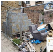
Environmental Crime and Anti-Social Behaviour