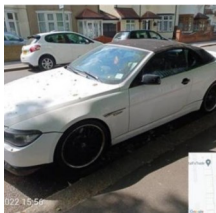
Nuisance Vehicles at South Park Road