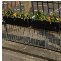
Planters on South Park Drive and Green Lane