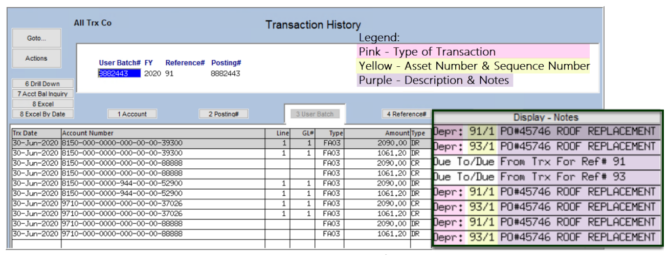
Figure 1 Legend colors are not on the actual screen; provided here for illustration

Ledgers ▶Queries ▶Transaction History ▶[3 User Batch]▶[Display – Notes]