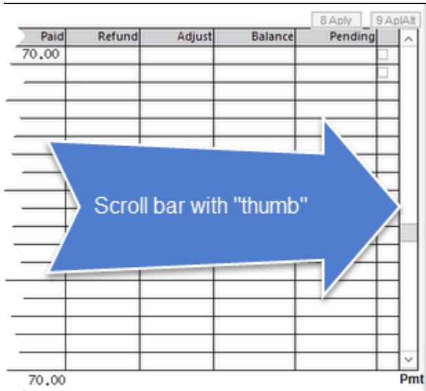
Figure 7 Before

Some sites with large data sets experienced a delay when viewing screens using scroll bars. The scroll bars were removed from multi-record screens to improve performance.