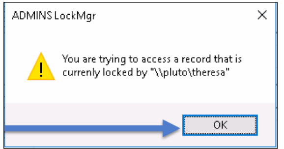
Figure 1 Popup notification that a record is locked

ADMINS is pleased to announce a new feature that will identify who you are record-locked with on a new record-locking screen. When a record-lock occurs, a popup screen will appear as shown in Figure 1. Click on [OK] .