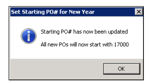
Figure 1 Set Starting PO # for New Year

This numbering affects POs created via the Create New from Posted method as well as those created from scratch.