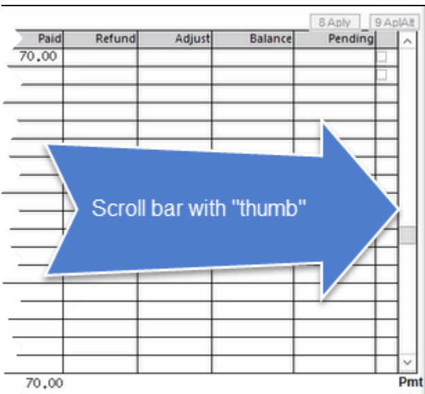
Figure 5 Before

Some sites with large data sets experienced a delay when viewing screens using scroll bars. The scroll bars were removed from multi-record screens to improve performance.