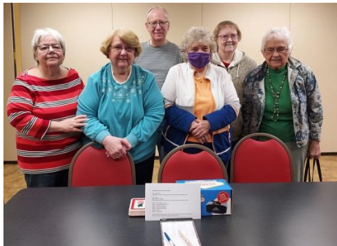
DCPASR Game Day at the Library--April 5, 2022

If you personally would like to make a donation in memory of one or more of those listed above, please see Page 23 for the necessary form.