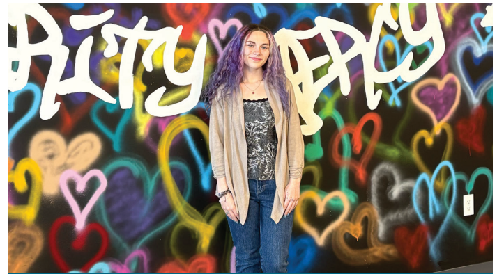
Client, Intern, Grand Traverse Industries

In addition to learning trade-specific skills, interns gained valuable experience in