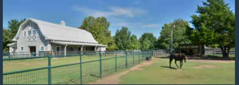
FARMS & RANCHES