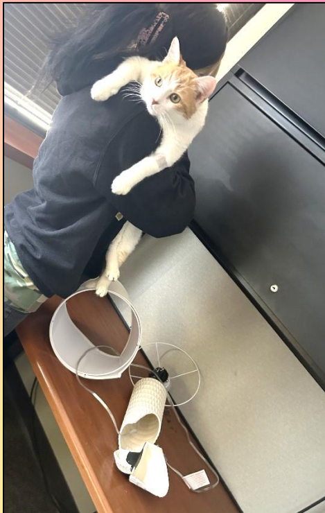
🚨 Naugty Pet of the Week 🚨 Buddy the cat chose chaos this week and swiped a lamp right off the window ledge. Zero regrets. Maximum drama.