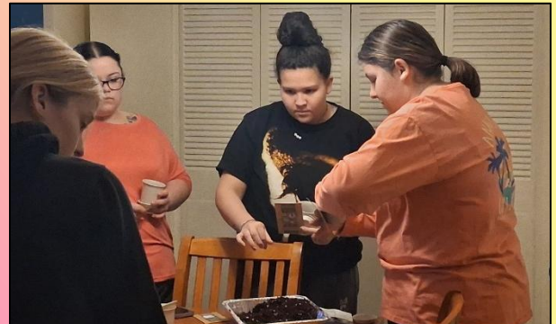
Students planted succulent seeds and learned the basics of starting plants from seed.