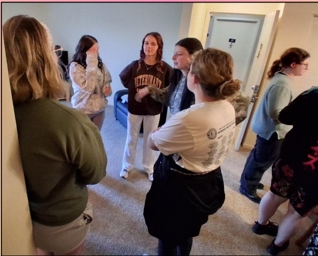
Students take time to talk and connect with each other during the ice cream social and succulent planting event.