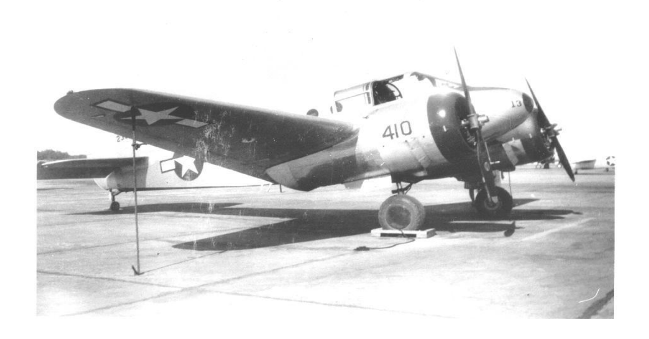
Columbus used AT-10s in its flying training program in World War II.

The citizens' efforts bore fruit. Six months before Pearl Harbor the War Department announced that a pilot training base would be established in Columbus. On 12 August 1941, Columbus officials leased the tract of land to the United States for $1 per year.