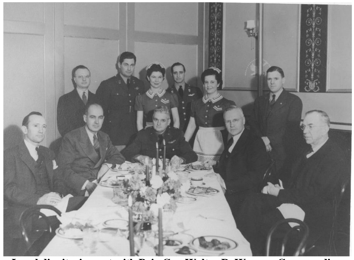
Local dignitaries met with Brig Gen Walter R. Weaver, Commanding General, Army Air Forces Southeast Training Center, when he visited the area in March 1941. The Army Air Forces was considering Columbus as the possible site of an air base.