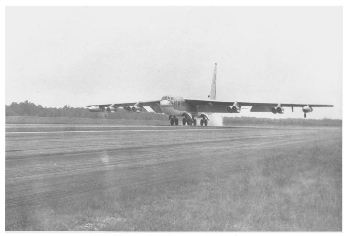
A B-52 touches down at Columbus.

After 14 years as a SAC base, on 1 July 1969, HQ USAF transferred Columbus back to Air Training Command and to its original mission of training pilots. In preparation for this transfer, Air Training Command had activated the 3650th Pilot Training Wing at Columbus on 15 February. The first undergraduate pilot training (UPT) class--71-01--entered school on 17 July.