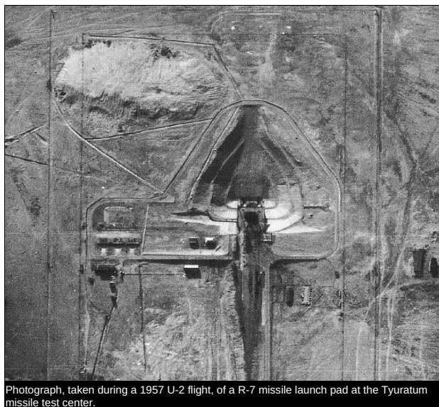
Photograph, taken during a 1957 U-2 flight, of a R-7 missile launch pad at the Tyuratam missile test center.