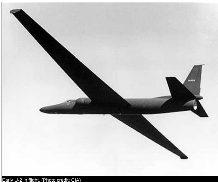
Early U-2 in flight.