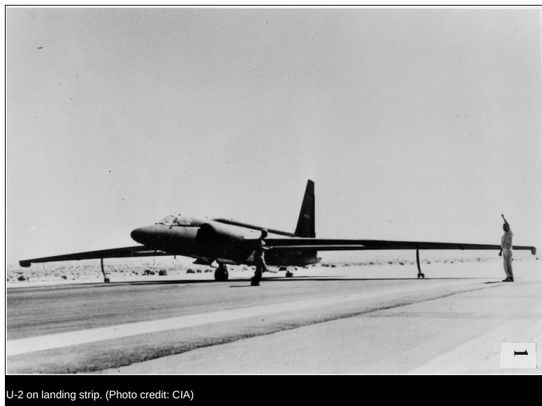
U-2 on landing strip.

The many books and articles written on the aerial reconnaissance programs, particularly the U-2 and the OXCART (and its Air Force variant, the SR-71), include much information about these topics, often with significant accuracy. 1 However, the newly released material provides a combination of significant new material, official confirmation of — or corrections to — what has been written, and official acknowledgment that permits researchers to follow up the disclosures with FOIA or Mandatory Declassification Review requests that may produce even more information. 2 Moreover, like any historical study, the CIA history may include errors that will require further scrutiny by researchers in the field.