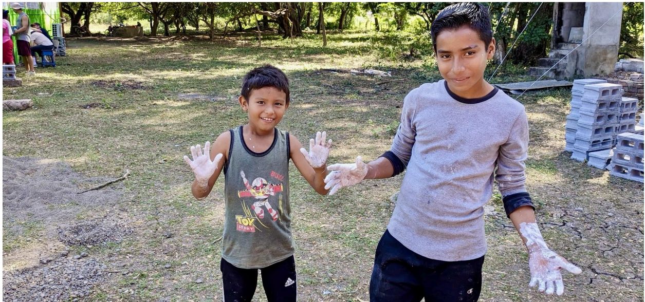
Children in Santa Ana helping us paint their new community center.