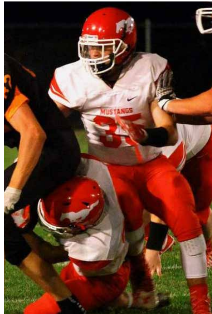
Prosser’s defense will have their hands full against Eatonville’s multi-threat of offense this Saturday.