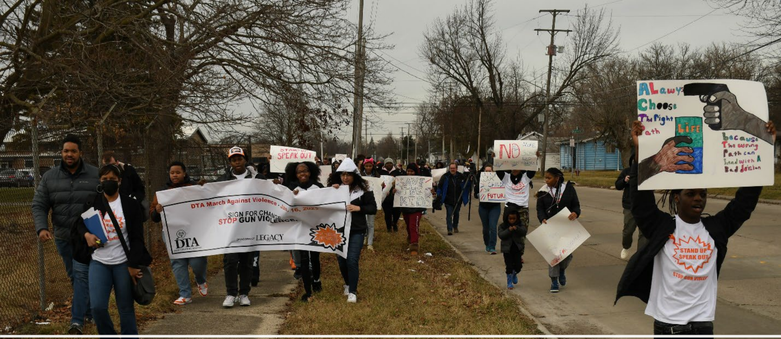
MLK DAY YOUTH MARCH AND RALLY AGAINST GUN VIOLENCE