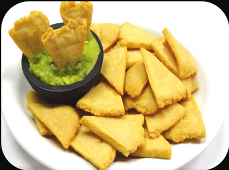
Mi Ranchito Guac. Dip