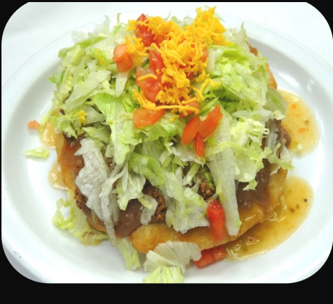
Mi Ranchito Taco