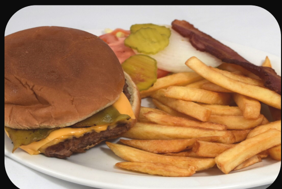
Mi Ranchito Burger

2 scrambled eggs mixed with ham, tomatoes, and onions.