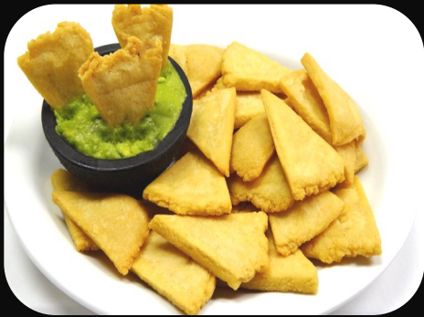
Mi Ranchito Guac. Dip