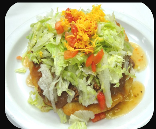
Mi Ranchito Taco