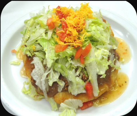
Mi Ranchito Taco