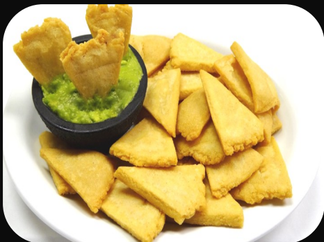
Mi Ranchito Guac. Dip