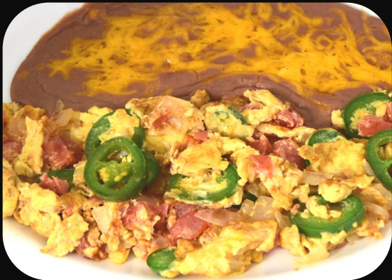
Huevos a la Mexicana