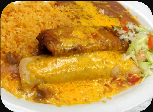
A. Enchilada & Tamale

All substitutions will be at least a $1.00