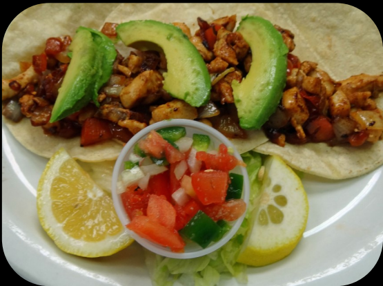
Tacos al Carbon