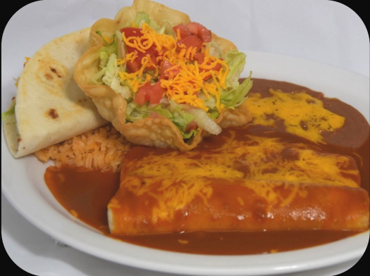
Large Combo 3