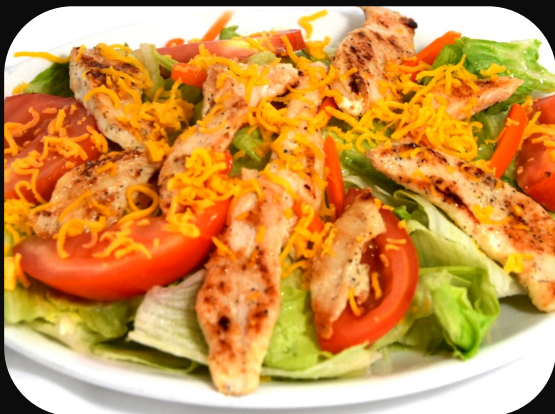
Grilled Chicken Salad

Chicken $9.25 | Steak $9.25 | Shrimp $10.99