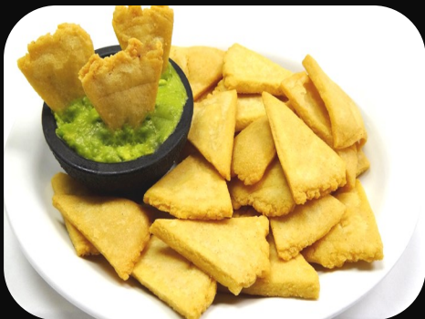
Mi Ranchito Guac. Dip