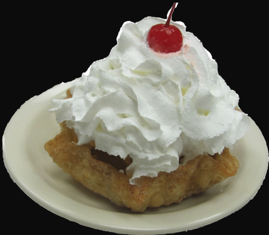
Fried Ice Cream

All substitutions will be at least a $1.00 extra