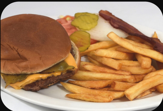
Mi Ranchito Burger

2 scrambled eggs mixed with ham, tomatoes, and onions.