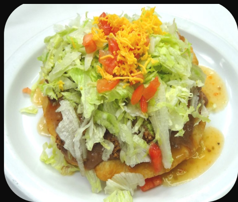
Mi Ranchito Taco