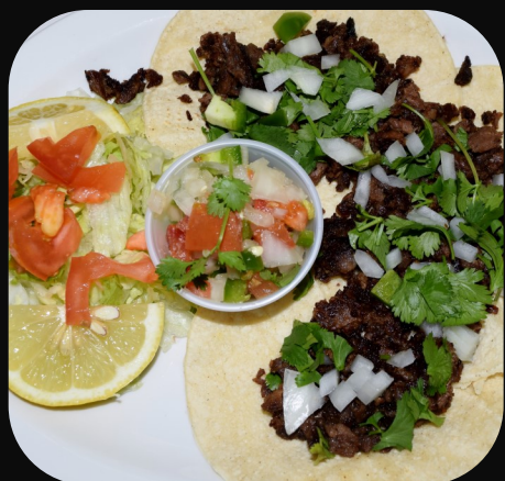
Tacos De Asada

*Chips & salsa are not included with to-go orders*