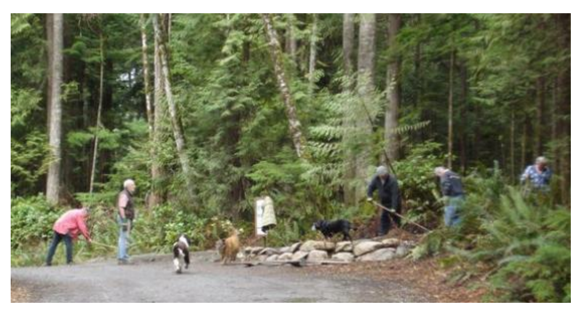
The wonderful last day of smoothing and compacting the start of the Trail.