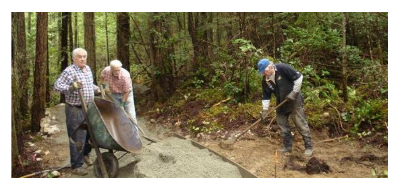
Just one shot of some of the wonderful volunteers at work. Spreading and smoothing.