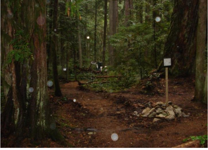
October 21, 2011 - The machine gets to the end to the pad for wheelchair turn around. On way out it will smooth trail. Next is compressing and crusher dust hauled in and compressed - lots of work.