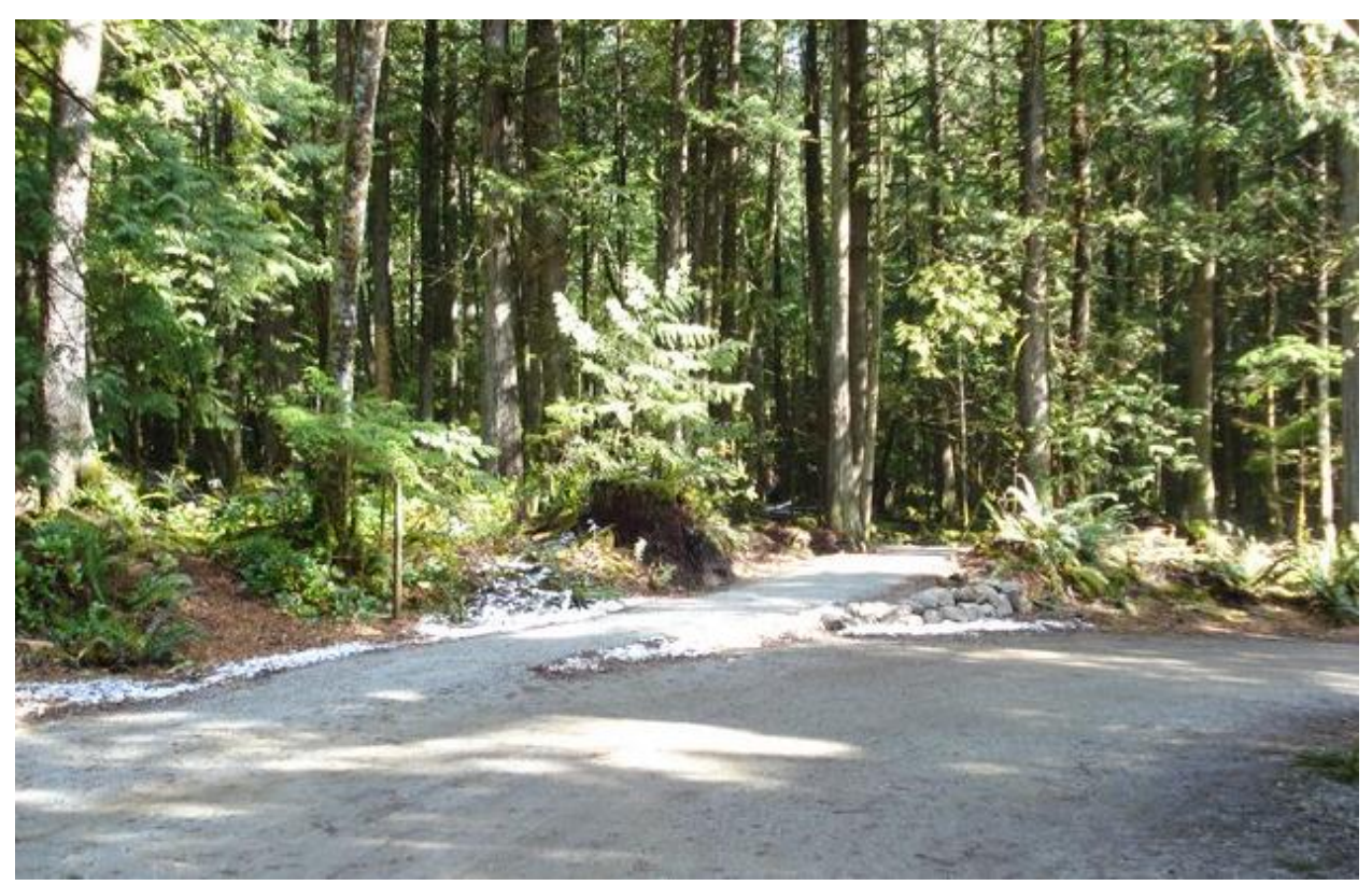
The start of the Trail as seen from the parking lot. Signage and some finishing touches to go.