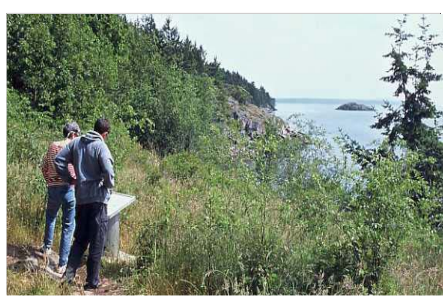
Dinner Rock recreation site, with the plaque commemorating the wreck of the Gulf Stream. Dinner Rock itself is in the background.