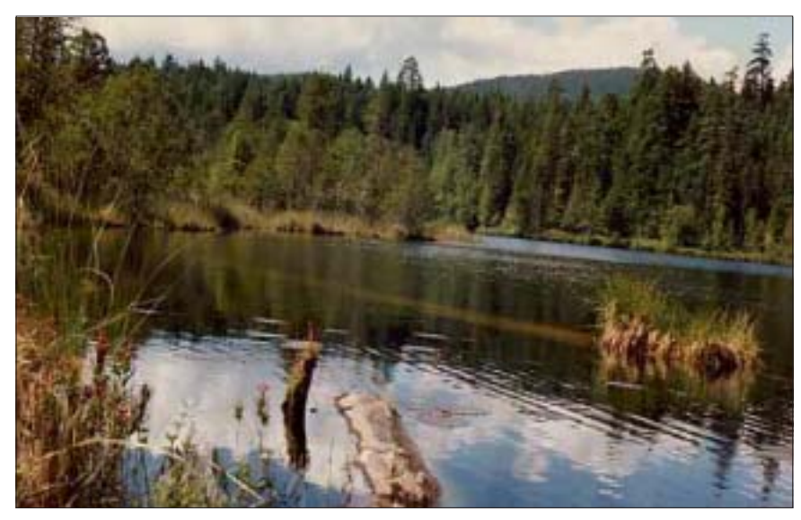
The Ambrose Lake Ecological Reserve, BC's finest example of a coastal bog ecosystem, is supposedly protected by tough legislation.

even stronger than Class A provincial parks. They are usually created for the perpetual protection of examples of ecosystems in their natural, undisturbed state, and as such are for the plants and creatures that live there, not for the enjoyment of humans. The only allowed uses are related to non-intrusive scientific investigation and education. A permit from the Parks Branch is techni-