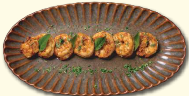
KASHMIRI BUTTER PRAWNS Fresh prawns, House chilli oil, Butter, Garlic 599