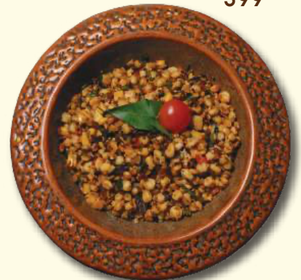
CURRY LEAF SWEET CORN Sweet corn and sweet corn fritters, Crispy curry leaves 399