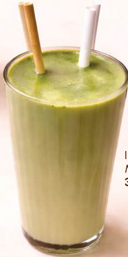
ICED MATCHA 379