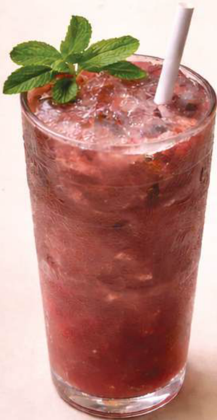
BERRY BLITZ 349