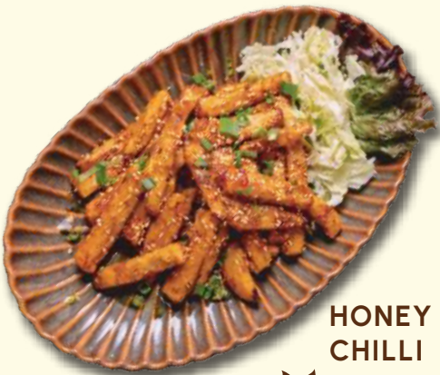
HONEY CHILLI POTATOES Crispy potatoes in in-house Honey Chilli sauce 439