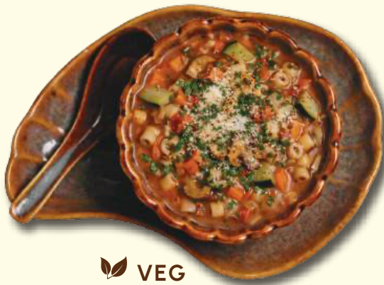
VEG MINISTRONE Italian vegetable soup, Pasta, Herbs 299