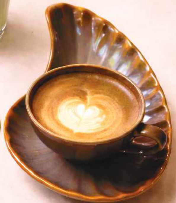
CINNAMON MOCHA 299