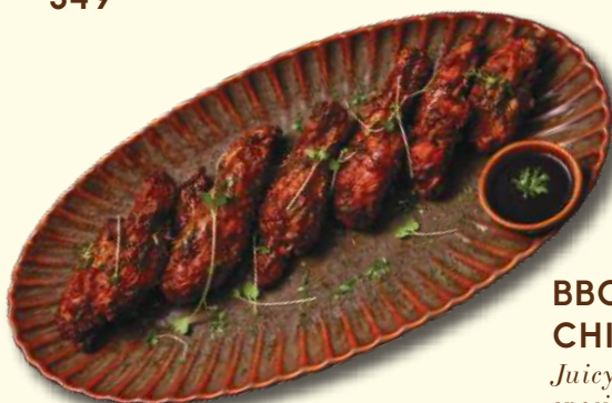
BBQ/ GUNPOWDER CHICKEN WINGS Juicy wings tossed in special barbeque sauce 499