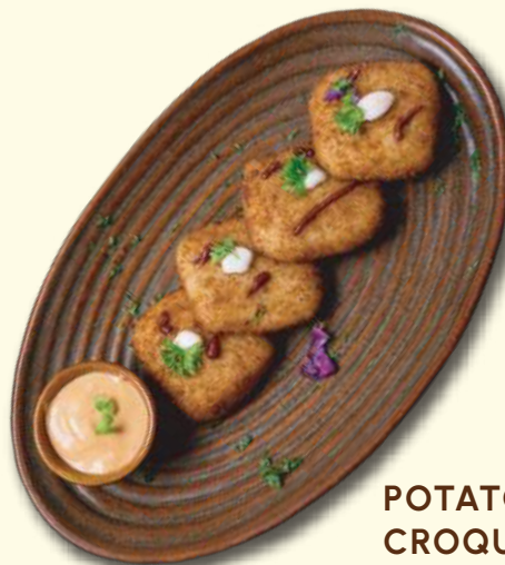
POTATO CHEESE CROQUETTES Mozzarella cheese, Mashed potatoes, Oregano, Basil 399