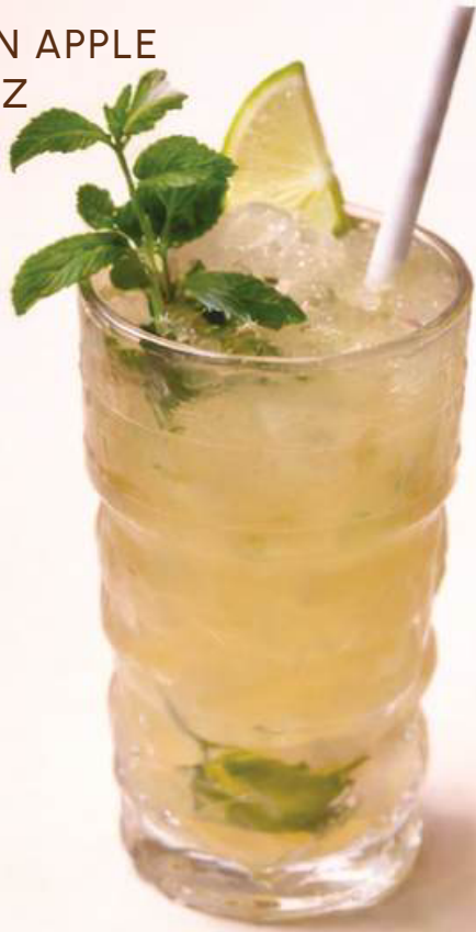
GREEN APPLE SPRITZ 349