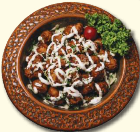
CHICKEN POPCORN Chicken popcorn, Sriracha mayo 349