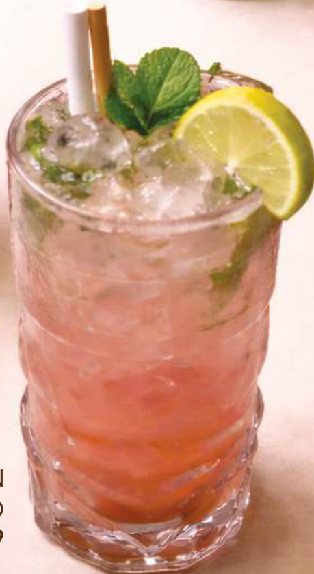
WATERMELON MOJITO 349