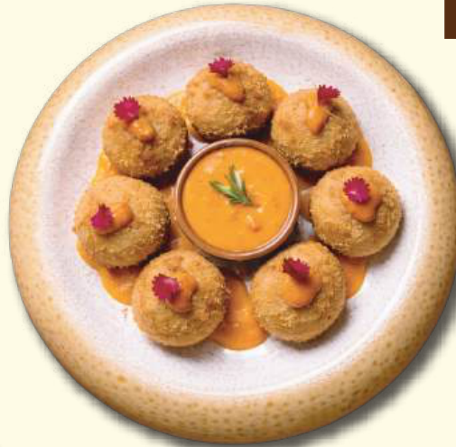
MAKHANI ARANCINI Risotto rice stuffed spiced arancini, Makhani sauce 449