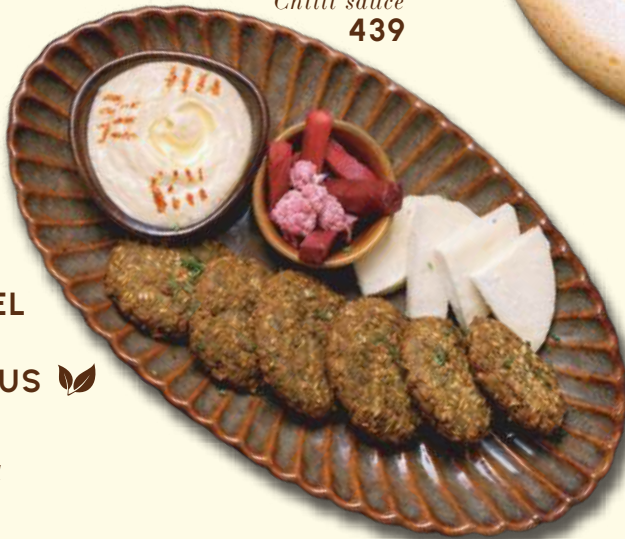
FALAFEL WITH HUMMUS House hummus, Pita bread 449