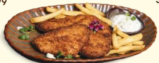
FISH AND CHIPS Classic seasonal fish and chips, Tartar sauce 699