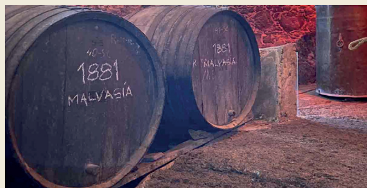
Two of the oldest wineries in Spain. Above, barrels of a Malvasía wine from Lanzarote from 1881 belonging to Bodegas El Grifo; and below one of the most prestigious houses in Rioja: Marqués de Riscal (1883)

But sometimes, the secret is not to think so much but to choose something that we know we like or, on the contrary, to let ourselves go and let other people to decide it for us. Of course, any case, it's about 'disfrutar' (enjoying).