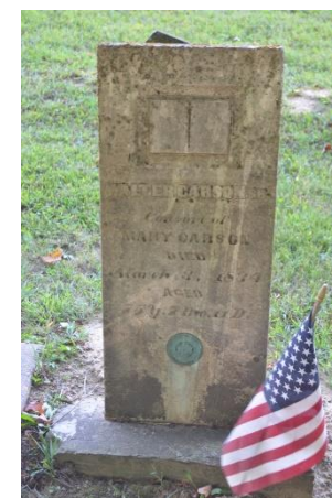
Graham Presbyterian Cemetery.