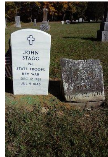
Hopewell Cemetery R