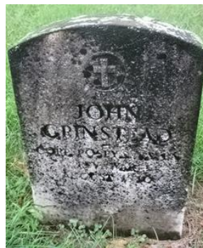
Otter Creek Cemetery

https://www.loc.gov/resource/g3701sm.gct00482/?sp=18&r=-0.298,-0.027,1.785,0.813,0