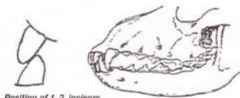
Position of 1, 2, incisors