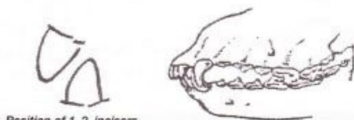
Position of 1, 2, incisors