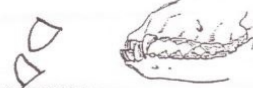
Position of 1, 2, incisors

Any deviation from the above please comment: Eg. Wry Mouth, etc: _____