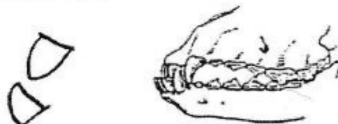
Position of 1, 2, incisors

Any deviation from the above please comment: Eg. Wry Mouth, etc: Nil