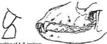
Position of 1, 2, incisors