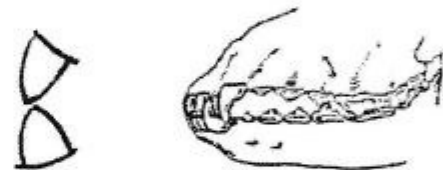
Position of 1, 2, incisors