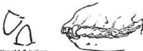
Position of 1, 2, incisors