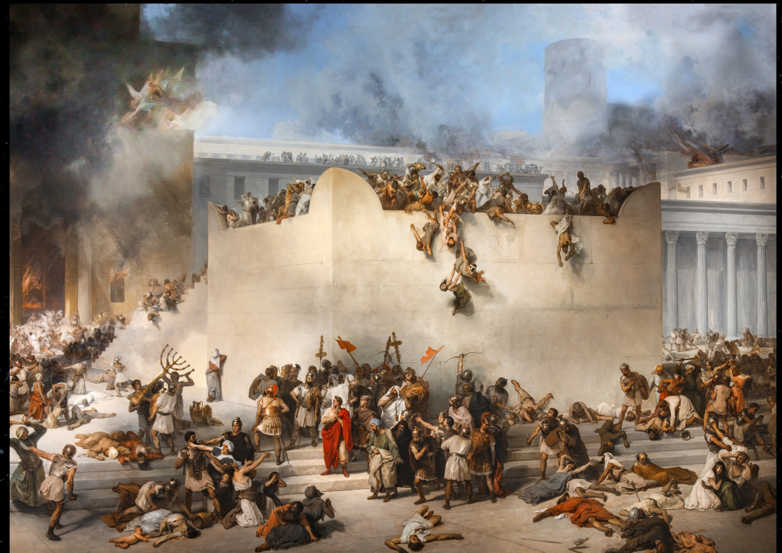
Sacking of the Temple in Jerusalem, 70 A.D.

Would you set up a landfill in the Grand Canyon?