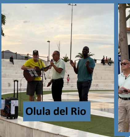
Olula del Rio