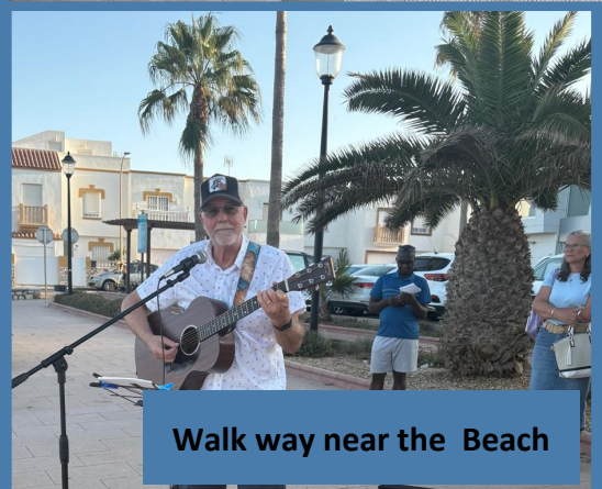
Walk way near the Beach