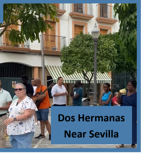
Dos Hermanas Near Sevilla