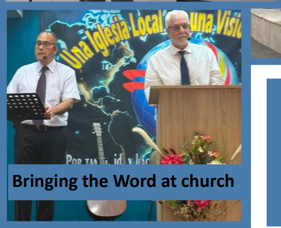
Bringing the Word at church