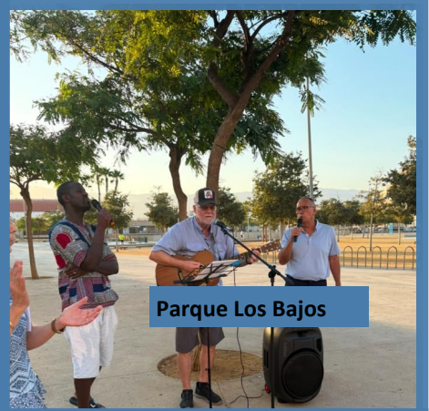
Parque Los Bajos