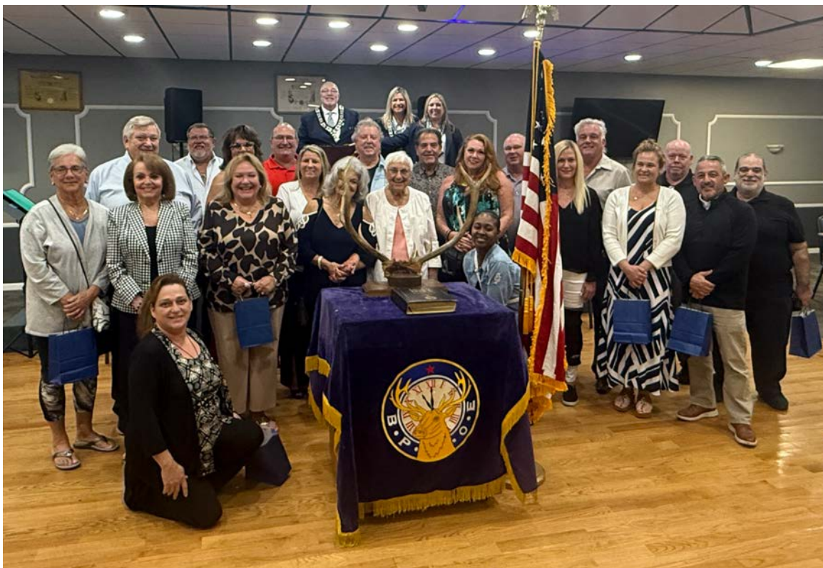
ONE LARGE INITIATION ON JANUARY 28, 2025. TWENTY-SIX (26) NEW ELKS