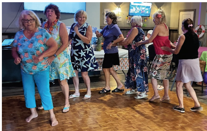
Conga Line Fun