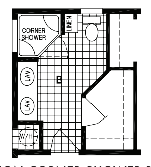
OPTION CORNER SHOWER BATH