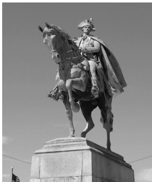
Gen Von Steuben in Milwaukee

During our Revolution, an out-of-work Prussian military man found himself in need of a job. Baron Friedrich Wilhelm von Steuben passed muster with the American Congress and found himself at Valley Forge as temporary Inspector General of the Continental Army. Appalled by the state of U.S. forces, Steuben took the lead in teaching soldiers the essentials of military drills, tactics, and discipline based on Prussian techniques. He devised a fifteen-step process for priming and loading a musket. And he drilled, drilled, and drilled some more. It was said that his efforts paid off in the battles that occurred after the winter of Valley Forge. He is honored with a statue in New York, Valley Forge, as well as Washington DC.