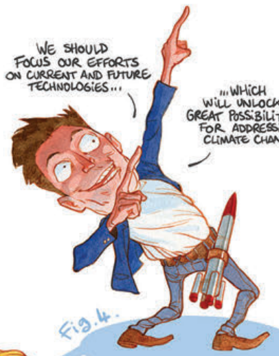
Fig. 4. Technological optimism

...WHICH WILL UNLOCK GREAT POSSIBILITIES FOR ADDRESSING CLIMATE CHANGE.