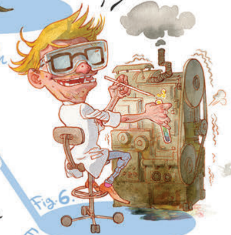
Fig. 6. Fossil fuel solutionism

OUR FUELS ARE BECOMING MORE EFFICIENT AND ARE THE BRIDGE TOWARDS A LOW-CARBON FUTURE.