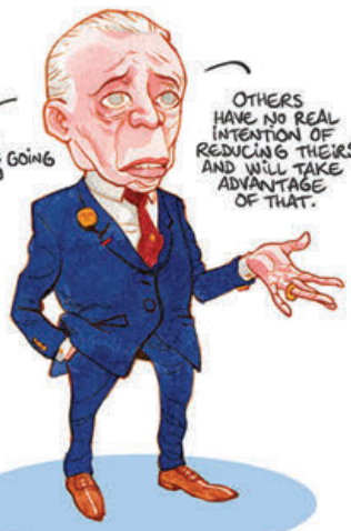
Fig. 3. The 'Free rider' excuse

OTHERS HAVE NO REAL INTENTION OF REDUCING THEIRS AND WILL TAKE ADVANTAGE OF THAT.