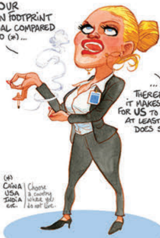
Fig. 1. Whataboutism