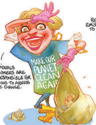
Fig. 2. Individualism

INDIVIDUALS AND CONSUMERS ARE ULTIMATELY RESPONSIBLE FOR TAKING ACTIONS TO ADDRESS CLIMATE CHANGE.