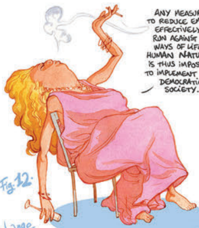
Fig. 12. Change is impossible

someone else should take actions first: redirect responsibility