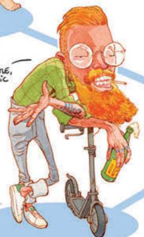
Fig. 11. Doomism

WE SHOULD ADAPT, OR ACCEPT OUR FATE IN THE HANDS OF GOD OR NATURE.