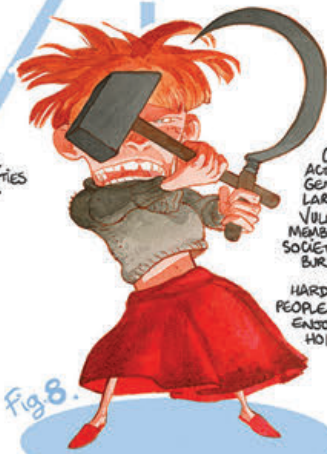
Fig. 8. Appeal to social justice

HARD-WORKING PEOPLE CANNOT ENJOY THEIR HOLIDAYS.