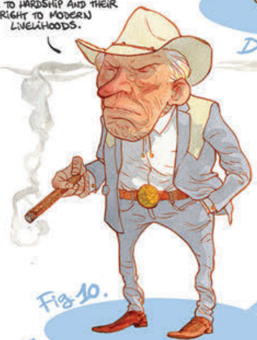
Fig. 10. Appeal to well-being

ABANDONING THEM WILL CONDEMN THE GLOBAL POOR TO HARDSHIP AND THEIR RIGHT TO MODERN LIVELIHOODS.