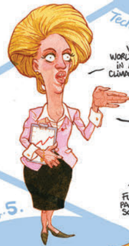
Fig. 5. All talk, little action

WE HAVE APPROVED AN AMBITIOUS TARGET AND HAVE DECLARED A CLIMATE EMERGENCY.