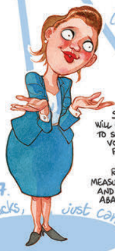
Fig. 7. No sticks, just carrots

RESTRICTIVE MEASURES WILL FAIL AND SHOULD BE ABANDONED.