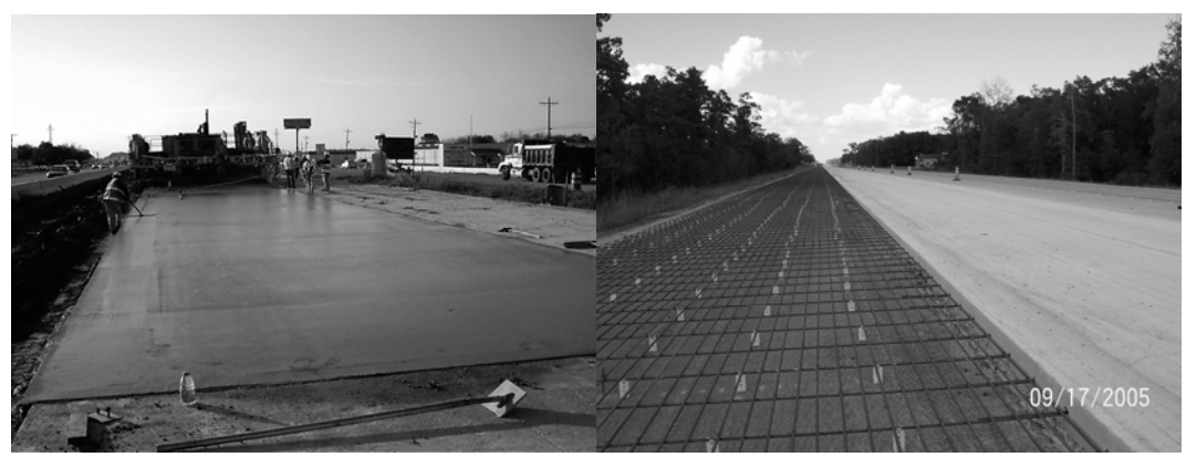
Fig. 3 Fresh (left) and hardened (right) concrete surface for Highway 69.

Regarding the energy consumption of producing EMC (50% FA) versus OPC, the following statements can be made: The manufacturing process of OPC consists primarily of quarrying or blasting of raw materials (limestone, clay), crushing, grinding, blending and conveying of the said raw meal to cement kilns where at high temperatures (about 1450 °C) the formation of Portland clinker takes place. The obtained clinker is further ground with gypsum to produce the final product Portland cement. EMC cement contains typically 50% of OPC and 50% of fly ash (FA). Production of such cement includes primarily grinding of FA to obtain fraction < 250 microns (if required), blending of the ground FA with OPC and processing of the said blend through EMC vibrating milling system to obtain the product with the similar size distribution as commercially available Portland cements (fraction < 150 microns). A comparison of the energies involved in the two processes is shown in Table 12, and one can see that the EMC with 50% fly ash only require 54% energy compared to OPC production. 50% OPC replacement should account for 50 % less CO<sub>2</sub>, but since EMC require somewhat more electrical energy in grinding the saving may be about 40% (providing that the energy production involves burning of fossil fuel).