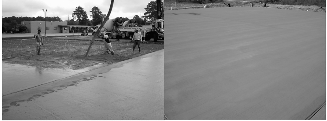
Fig. 2. Pouring concrete for the truck stop (left) and concrete surface of the truck stop after setting (right).

Later a part of Highway 69 in Texas was made by concrete with 50% OPC replacement by EMFA. The total cementitious material was 280-300 kg/m<sup>3</sup> and it achieved 15-20% higher 28 day strength than specified and 50% reduction in cracking compared to traditional pavement according to Texas Department of Transportation. Surface finish was excellent and reduced labour requirements. Some photos are shown in Fig. 3.