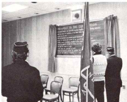
Officers at a recent meeting leading the reading of the Preamble