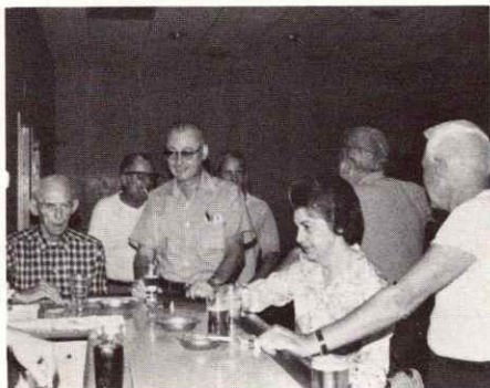
Some of the Friday night workers at work a few months ago. Do you recognize yourself?