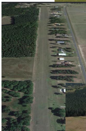
South end, before and after