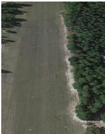
North end, before and after

A mulching contractor worked on the west taxiway in March to remove encroaching trees and limbs. A big improvement for our airstrip!