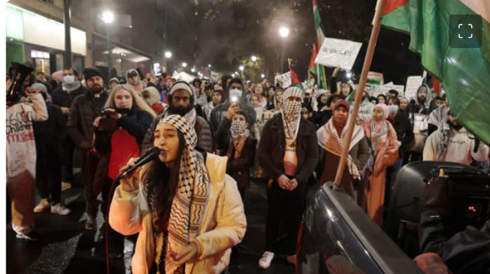
Antisemitic protest at Philadelphia restaurant draws broad condemnation

Lawmakers on both sides of the aisle have publicly condemned the antisemitic protest that took place outside a restaurant that serves Israeli food in Philadelphia.