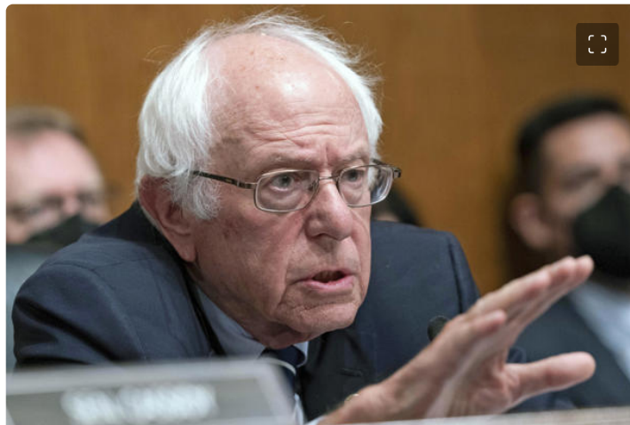
Sen. Bernie Sanders opposes giving Israel $10 billion in aid