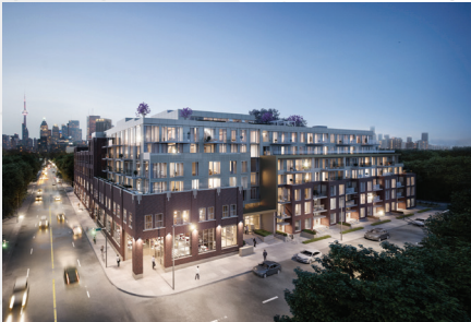
WONDER CONDOS & LOFTS, TORONTO