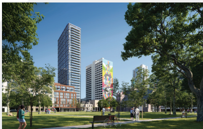
JAC CONDOS, TORONTO