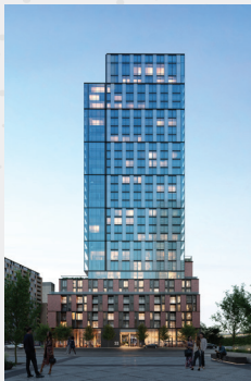
THE GOODE, TORONTO