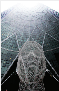
WONDERLAND SCULPTURE & THE BOW BUILDING