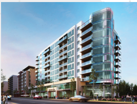
THE THEODORE, CALGARY