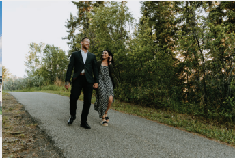
FISH CREEK PROVINCIAL PARK