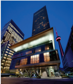
RITZ CARLTON HOTEL & RESIDENCES, TORONTO