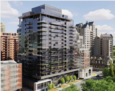
FIRST & PARK, CALGARY