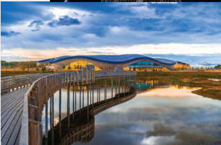
SHANE HOMES YMCA AT ROCKY RIDGE