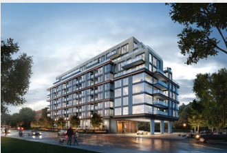
250 LAWRENCE, TORONTO