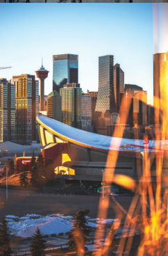
CALGARY TOWER & THE SCOTIABANK SADDLEDOME