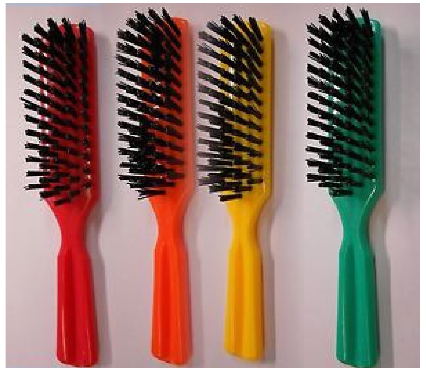
HARD BRISTLE BRUSH