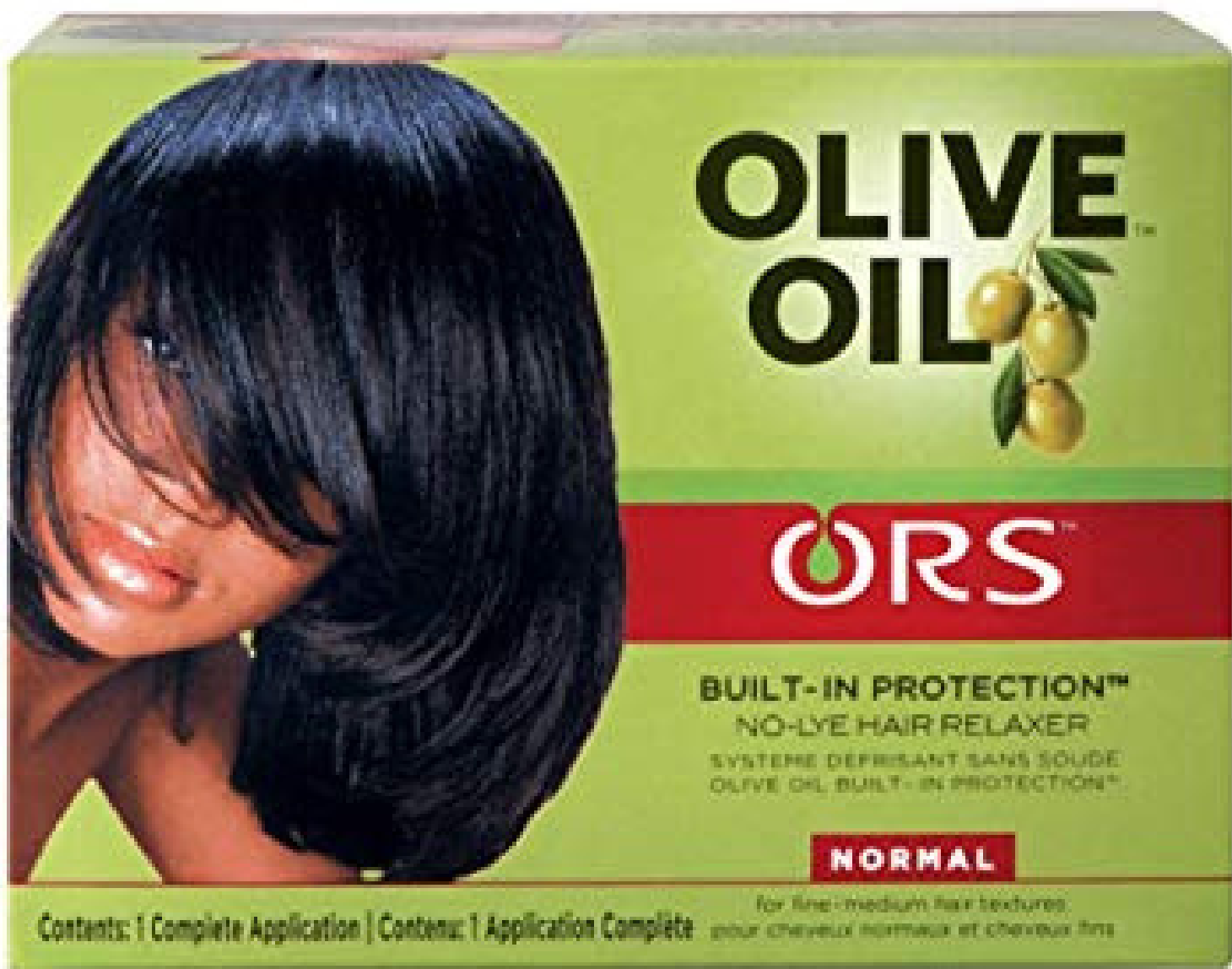
OLIVE OIL HAIR RELAXER