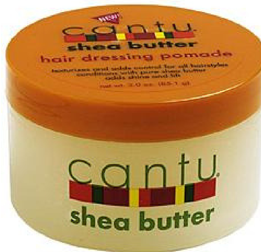
SHEA BUTTER HAIR GREASE