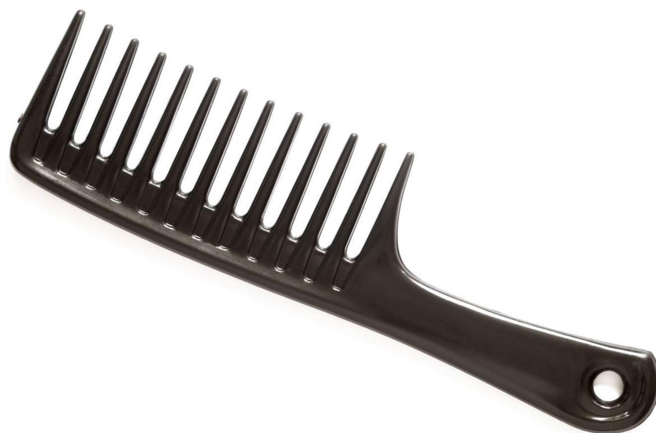
WIDE TOOTH COMB

Breaking Free's main population is African American women and girls, we have an on-going need of African American hair products