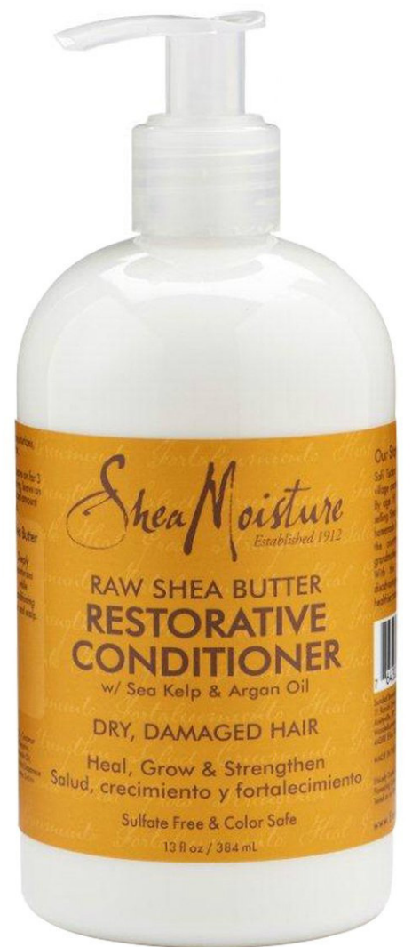
SHEA MOISTURE SHAMPOO & CONDITIONER