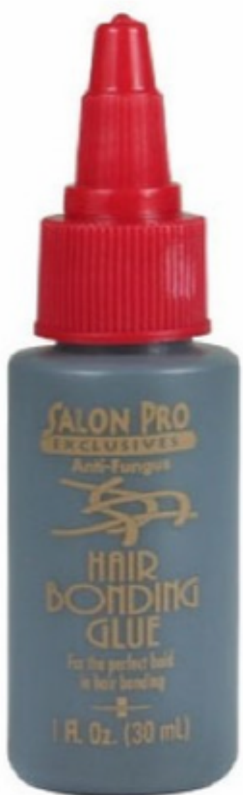
HAIR BONDING GLUE