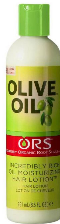
OLIVE OIL HAIR LOTION