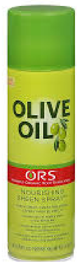
OLIVE OIL HAIR SHEEN