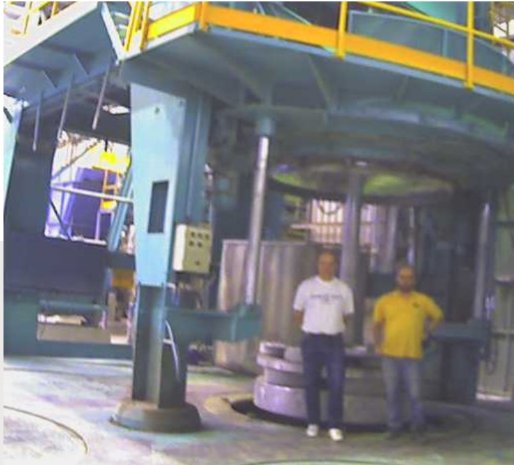
2.2 mt (84'') PACKERHEAD UPGRADE