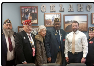
Attending Washington Conference Meeting with Senator Marwayne Mullen