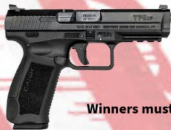
CANIK TP9SF 9MM

Thank you for supporting the Oklahoma American Legion Family and Oklahoma Veterans.