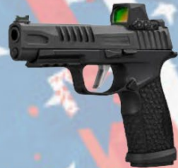
SIG SAUER P365 9MM FUSE ROMEO X COMPACT SITE 2-21 RND & 1-17 RND MAG