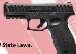
STOEGER STR-9 9MM

Winners must be of age and pass a background check and all IAW State Laws.