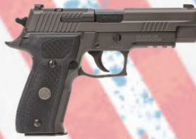
SIG SAUER P226 9MM