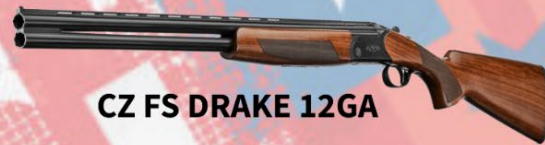
CZ FS DRAKE 12GA