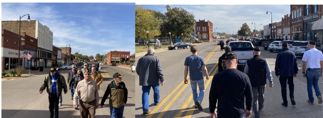
Perry's Veterans Day Parade