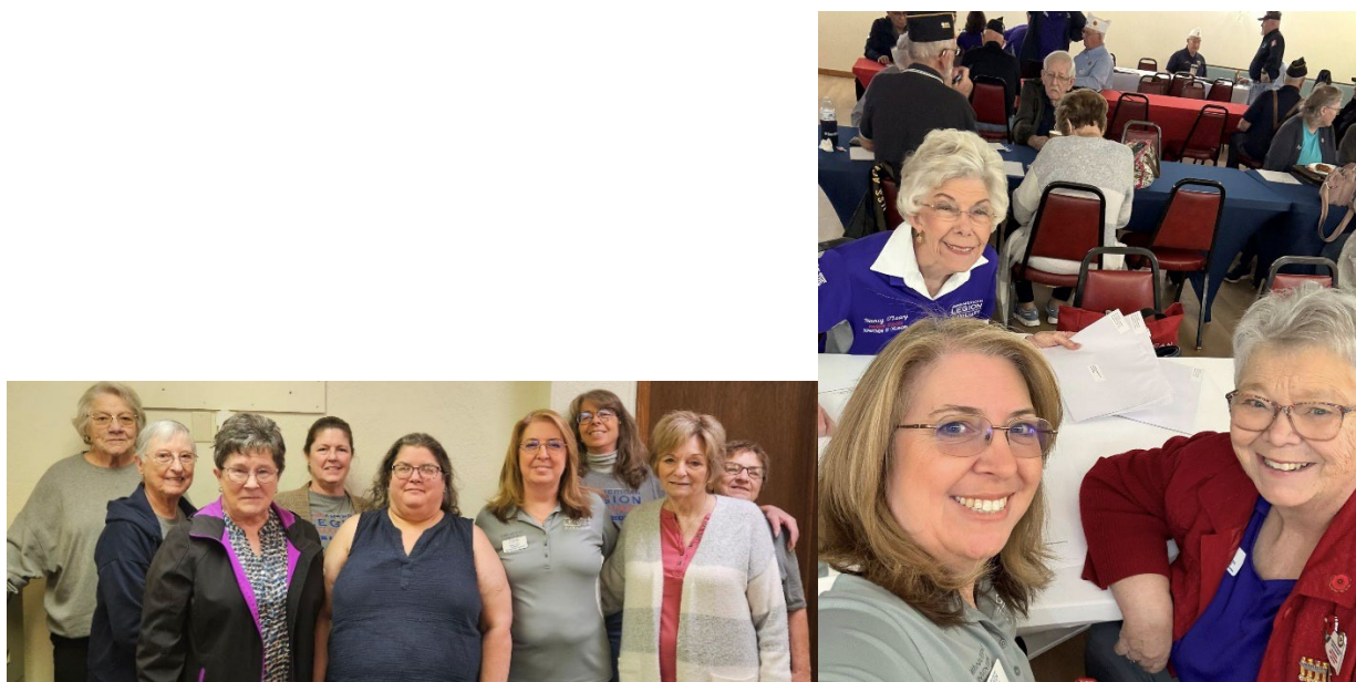
We finally have ALA officers for district 7! Sayre has been blessed with an amazing new facility and are working hard to get it all put together. Good job! It is going to be amazing!