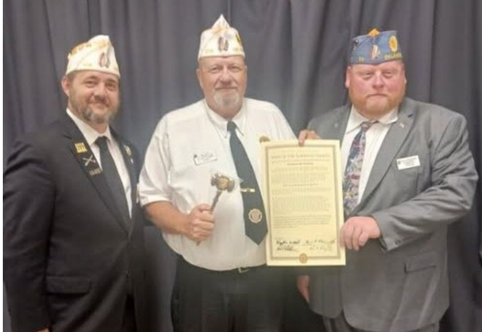
Receiving our SAL Squadron Charter.

PLEASE SEND ALL SUBMISSIONS TO TALOK1889@GMAIL.COM NO LATER THAN THE 28 TH OF THE MONTH