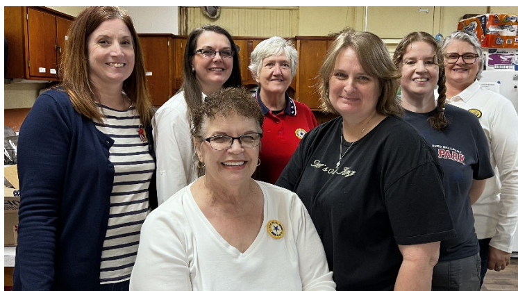
Members of the ALA and Volunteers that helped with the meal following the Parade.