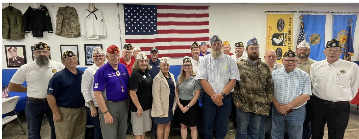
District 8A & 8B Fall Conference 27 September