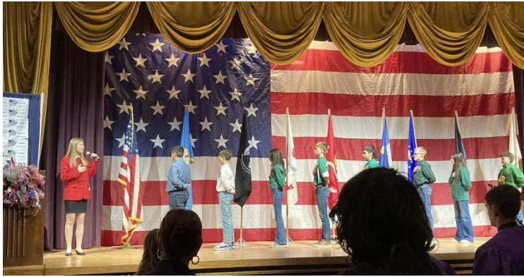
Veteran's Day School Program