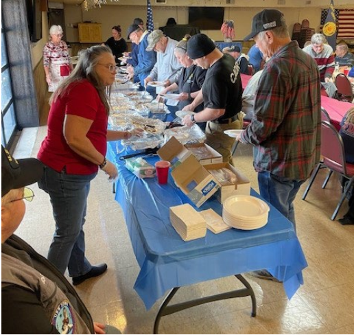
Veterans Day in Vinita at Post 40 we had a program at the Monument followed by a meal at the Post