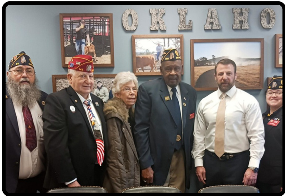
Attending Washington Conference Meeting with Senator Marwayne Mullen