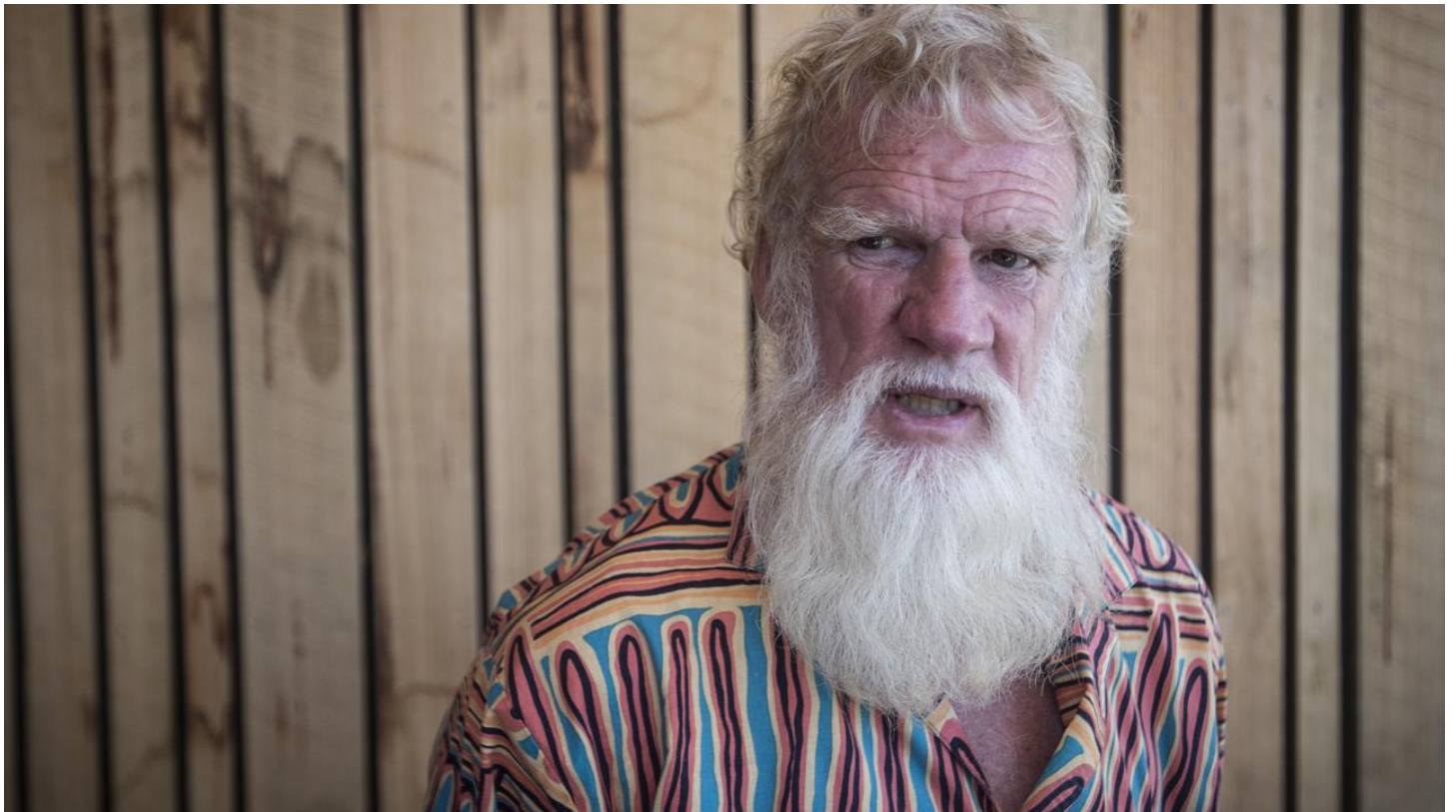
Dark Emu author Bruce Pascoe.