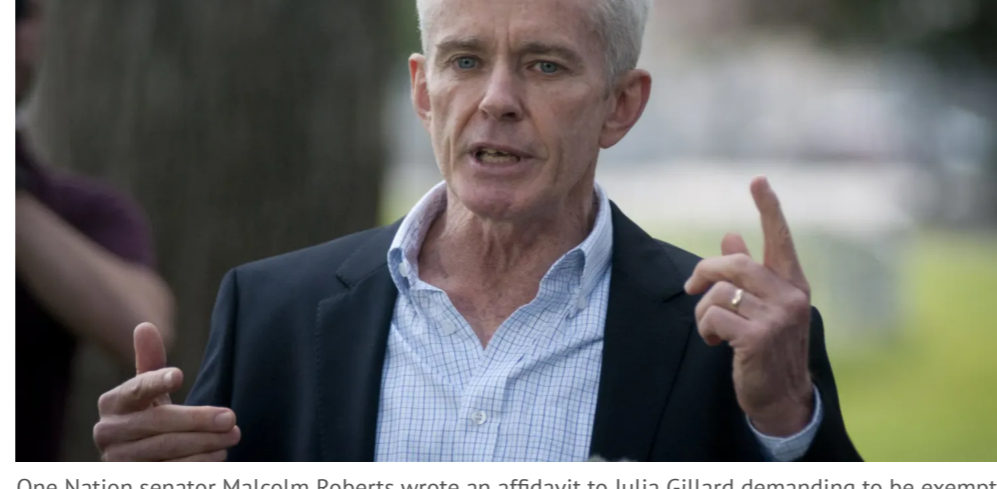
One Nation senator Malcolm Roberts wrote an affidavit to Julia Gillard demanding to be exempt from the carbon tax.

NSW Police say such people 'should be considered a potential terrorist threat'.