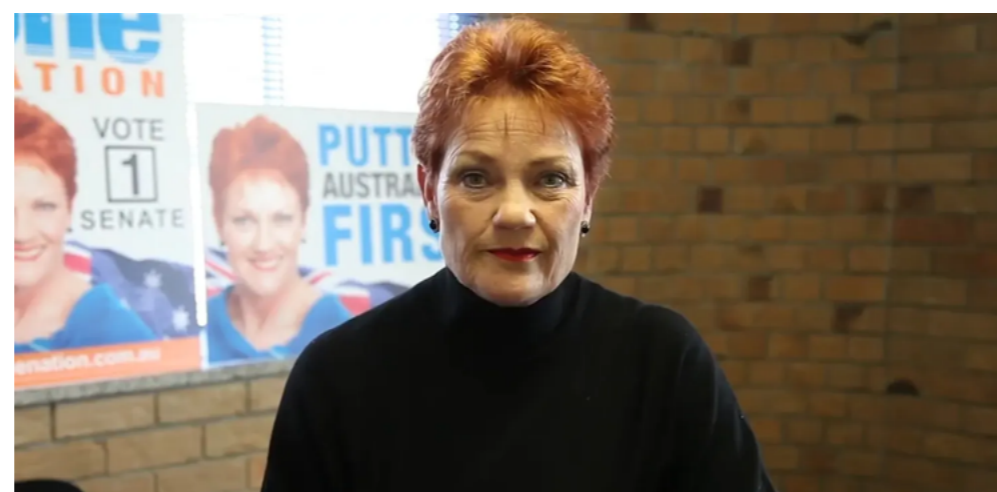
One Nation leader Pauline Hanson controls three senators in the new Parliament including Mr Roberts.

'They consider themselves individuals and operate outside the law and outside our tax system.'