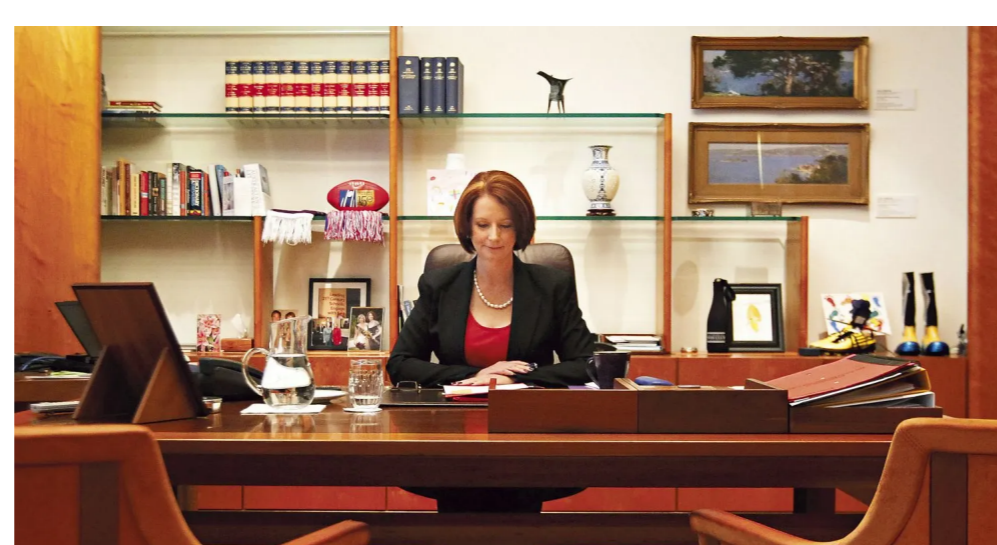
Former prime minister Julia Gillard.