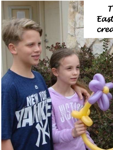
The balloon artist at the Easter Egg Hunt made special creations for all the children.